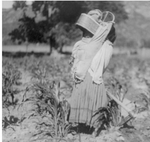
Apache woman and child hoeing corn field

THREE SISTERS GARDEN NATIVE AMERICAN GARDEN PIMA AND WESTERN APACHE