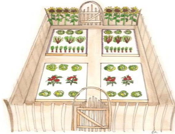
Typical Foursquare Garden